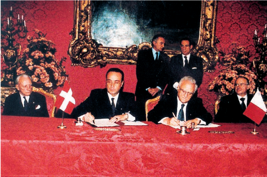
Signing the new agreement between the Order and the Republic of Malta on Fort St. Angelo