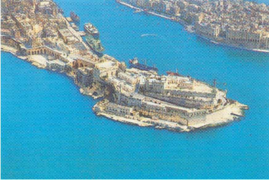
View of Fort St. Angelo, centre of Malta's defensive system.