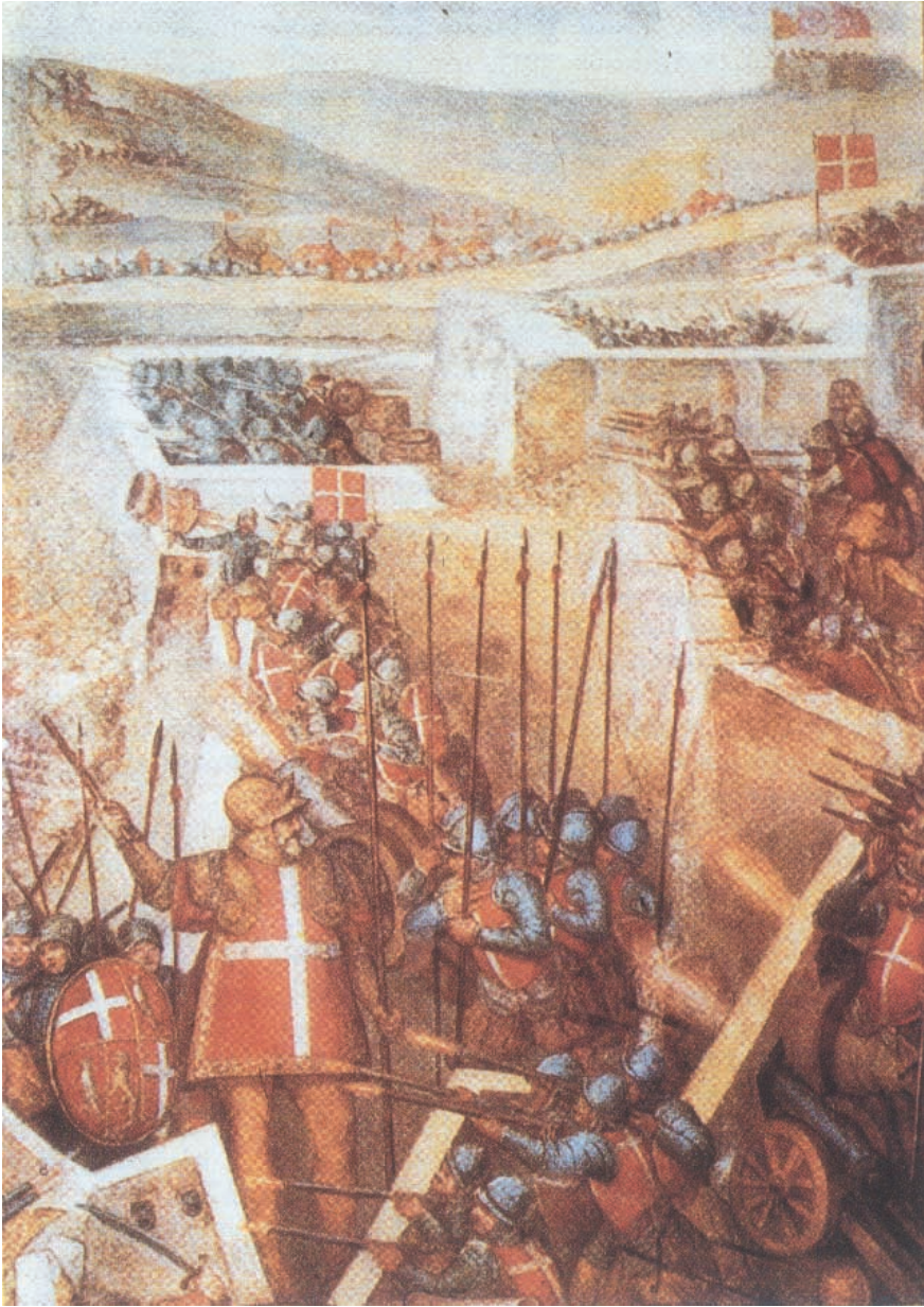
Grand Master Fra' Jean de La Vallette exhorting his Knights on the ramparts of Malta.