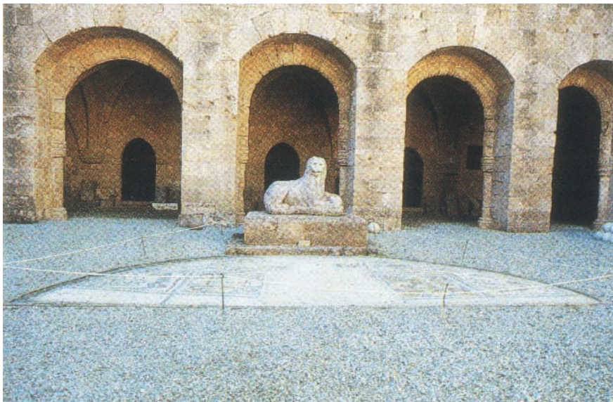
The courtyard of the Hospital, one of the major sanitary structures of its time.