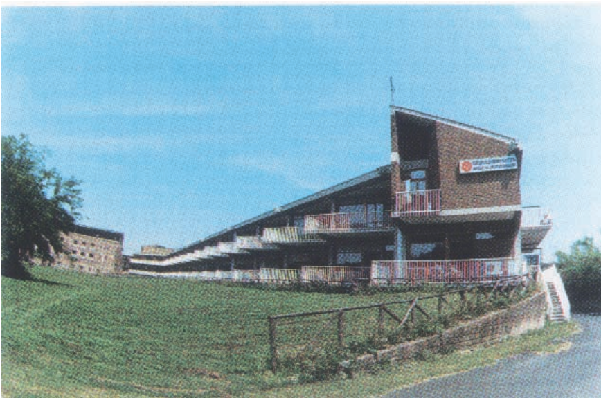
Wing of the St. John the Baptist Hospital at Magliana (Rome)