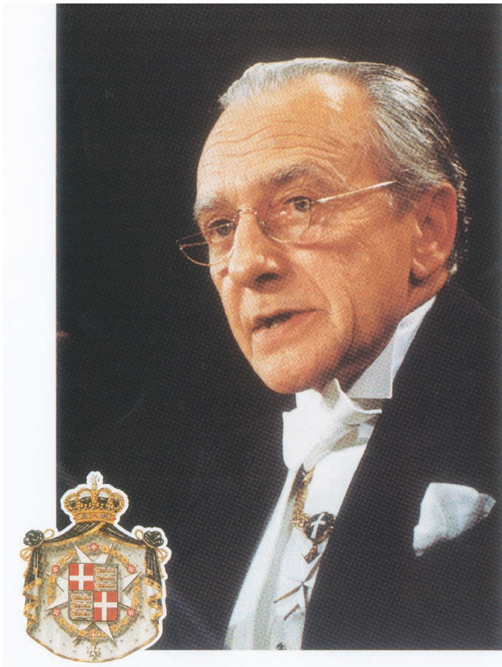
Frà Andrew Bertie Prince and Grand Master of the Sovereign Military Order of Malta.