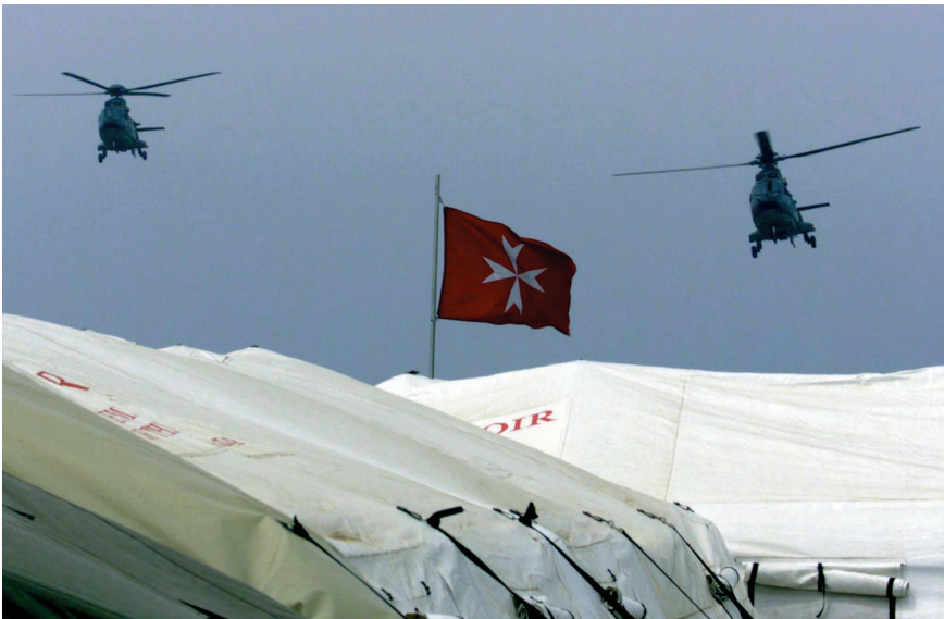
Albania May 1999: The Order of Malta's Flag flies over a field hospital set up by its international bodies