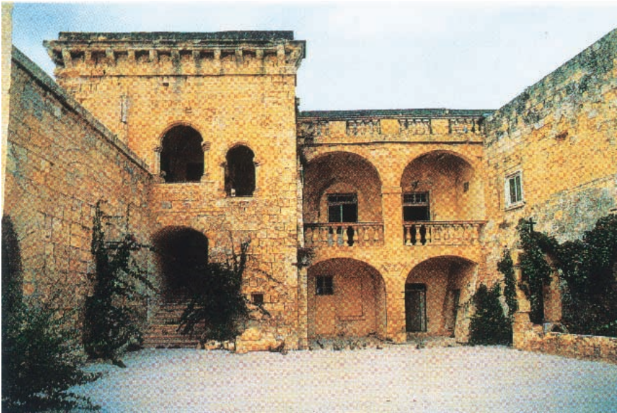
Palace from where Fra' Jean de La Vallette conducted the various phases of the long Siege.