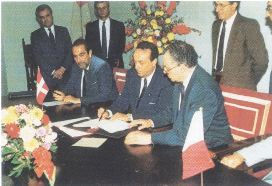
Signing the agreement between the Order and the Republic of Malta at Fort St. Angelo (21 June, 1991)