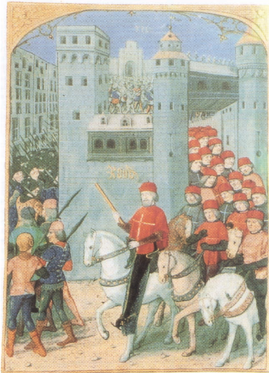
The Siege of Rhodes: Fra' Pierre d'Aubusson pays homage to Our Lady of Philermo, Protector of the Order.