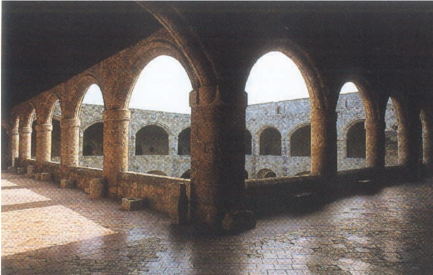
The Hospital at Rhodes, built by Grand Master Fra' Jean de Lastic.