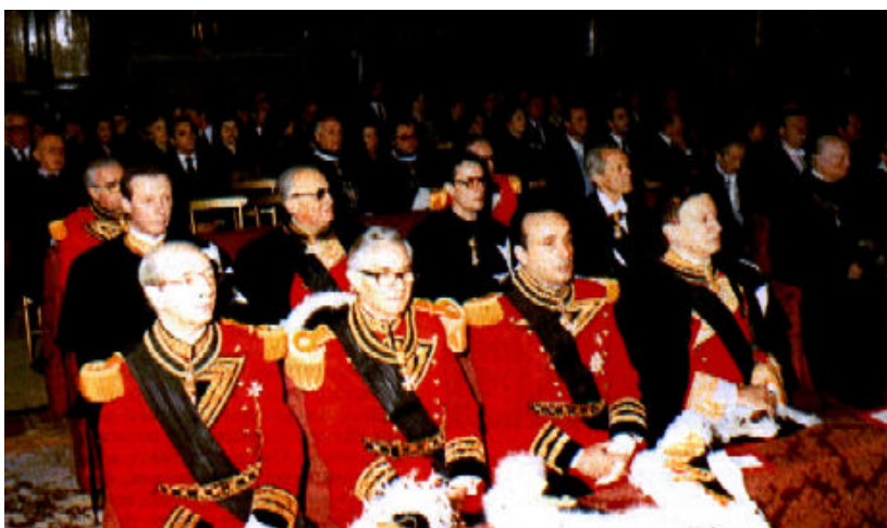
Roma. Basilica dei SS. Apostoli.