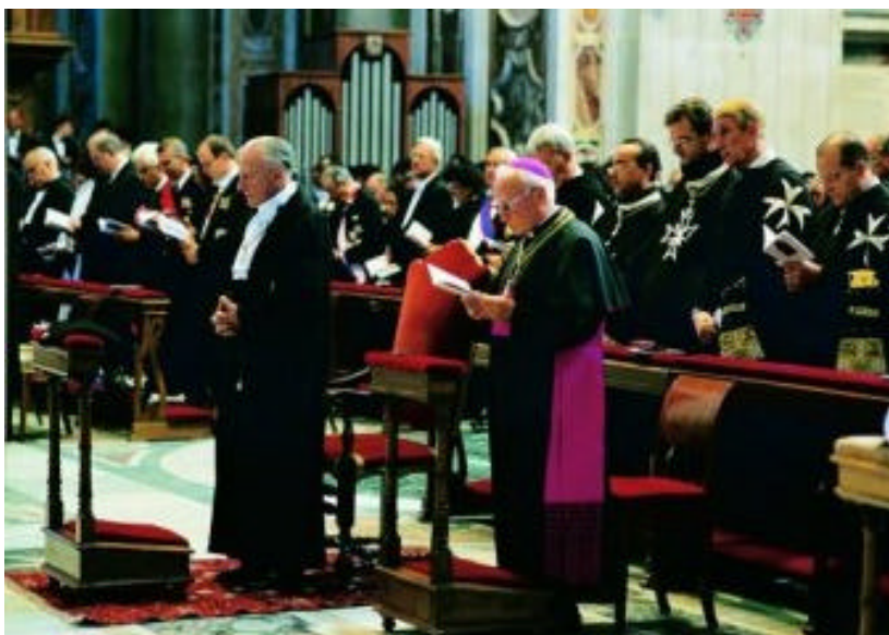
Roma. Basilica di San Pietro.