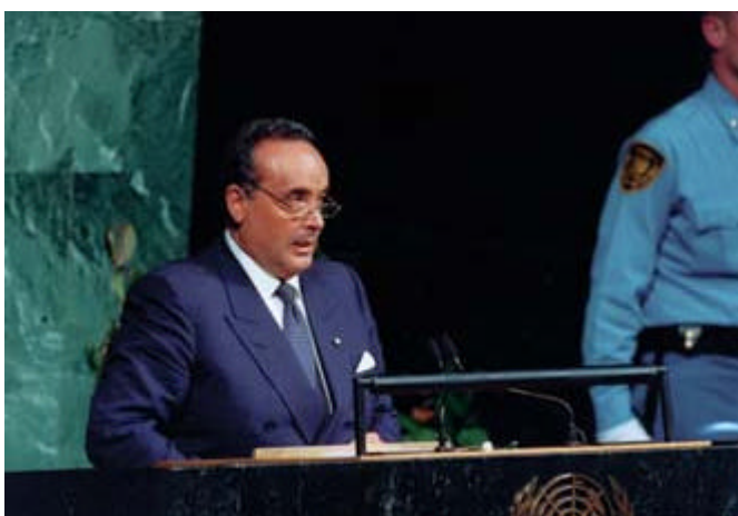
New York. Palazzo di Vetro delle Nazioni Unite.

The Sovereign Military Order of Malta congratulates the Secretary General on the high moral content of his speech, and wishes humbly to remind Heads of State and Heads of Government convened here of some priorities, in the firm belief that when going home, as the Secretary General said, they will make their best efforts and use their powers in order to lessen differences and omissions, especially at this stage in the history of mankind in which the globalisation of markets, unless adequately governed, may lead to a deepening of the existing imbalances, thus making richer the already rich countries, and poorer the already poor ones.